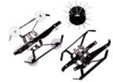
6"-15" CENTERING SKIDS ROLLER SKID [LEFT], BRUSH SKID [MIDDLE], ALUMINUM SKID [RIGHT]