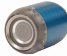
PRO EYE SELF-LEVELING COLOR CAMERA HEAD