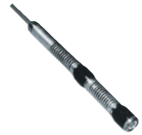
TRACKER™ IN-LINE TRANSMITTER