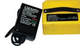
AC BATTERY PACK KIT