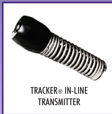
TRACKER® IN-LINE TRANSMITTER