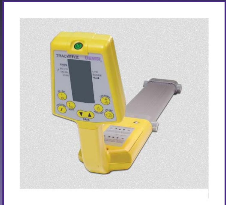
Tracker II Receiver

With multi-frequency capabilities, the Tracker II in the 512 Hz mode, can locate the transmitter inside cast iron, clay, PVC, concrete or transit pipe at depths up to 24'. It can also detect live power lines or cable television lines in the 50-60 Hz mode. Also, using the optional 65 KHz transmitter with conductive attachments (not shown), the user can track water and gas pipes.