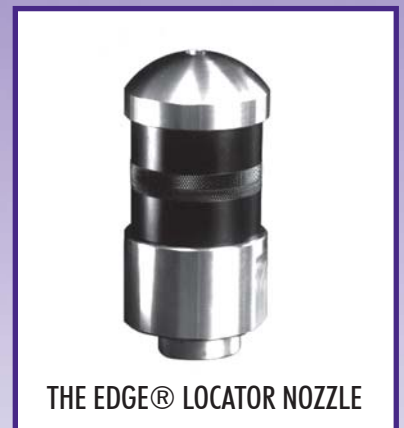
THE EDGE® LOCATOR NOZZLE

UEMSI PIPELINE CLEANING & TELEVISION EQUIPMENT